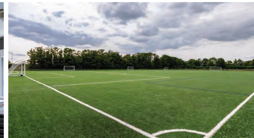
Left Page: Student Communal Space, Sports Hall and Staircase. Right Page: School Hall with Chapel, Science Labs, Astro turf Football Fields.