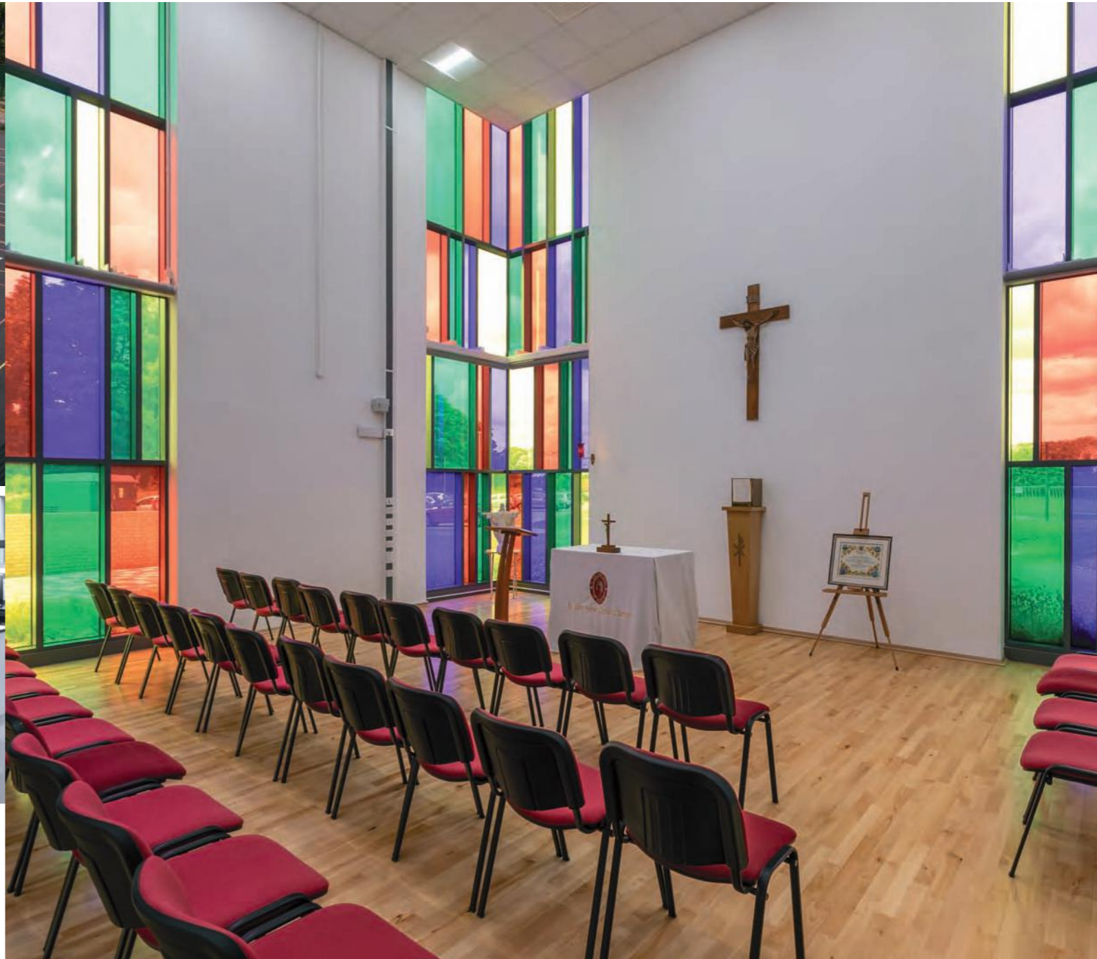
Left Page: Sports Grounds, Design & Technology Room & Computer Suite. Right Page: Chapel.